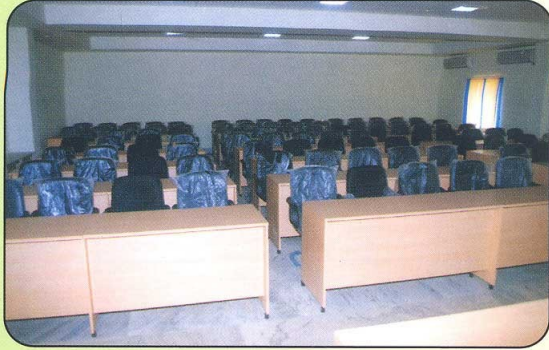
A/C Conference Hall with LCD Projector Facility