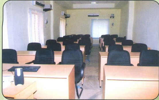
A/C Class Rooms