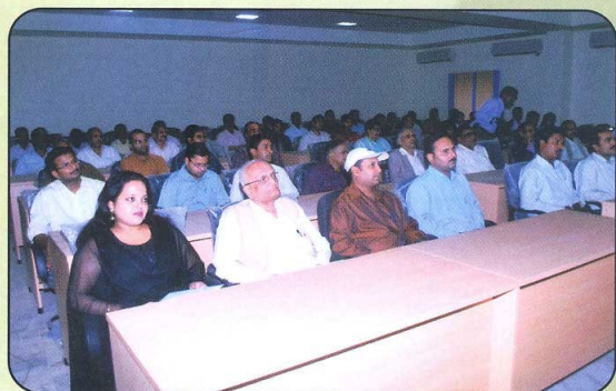
Launching of MDC Website