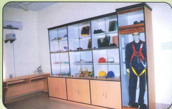
Personal Protective Equipment in the Laboratory